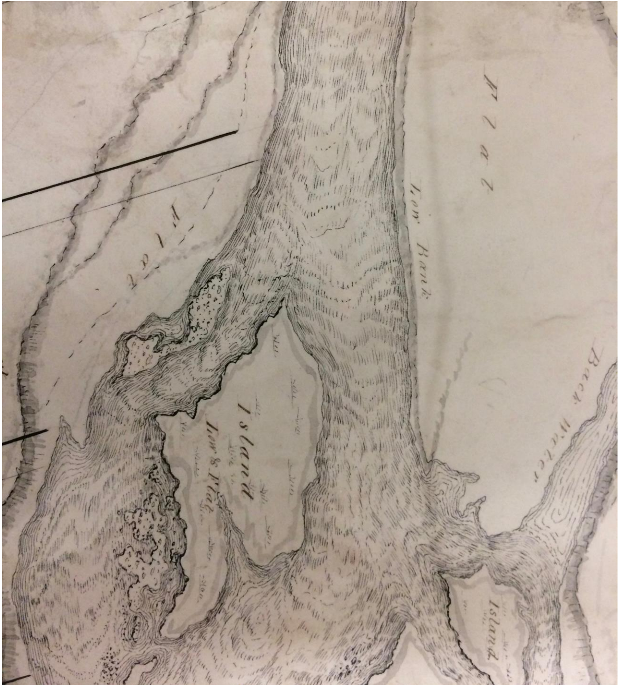
Figure 3 Otonabee River Shoreline Between Simcoe and King Streets, Circa 1830

The artwork will be installed overlooking the Otonabee River within Millennium Park at Nogojiwanong, at a site as yet to be determined.