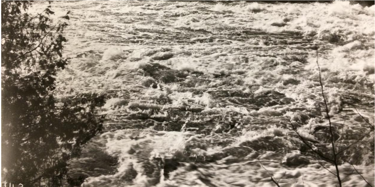
Figure 1 Otonabee River Rapids

The Nogojiwanong Project Committee invites Indigenous artists or artist teams residing in Ontario to submit their credentials, examples of prior experience and a conceptual approach for a site-specific public artwork to be installed at Nogojiwanong—the Place at the Foot of the Rapids on the territories of the Michi Saagiig Anishinaabe Peoples.